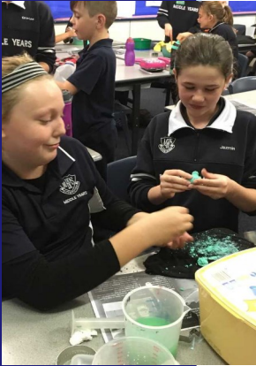
STEM in Action Room 4